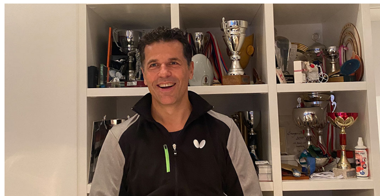
Zoran Primorac at home in his native Croatia.

READ MORE in this exclusive interview with Zoran Primorac, Chair of the ITTF Athletes Commission.