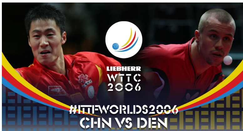
Click on the image to watch highlights from the 2006 World Table Tennis Championships!