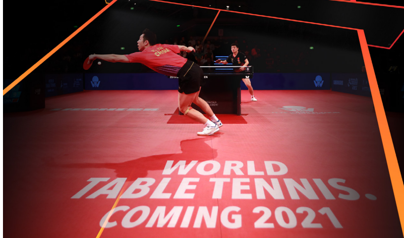
World Table Tennis coming 2021