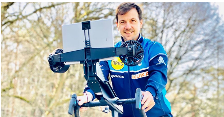
Timo Boll training from his garden in Germany.

These videos focus on the creative methods adopted by players and fans to combat the virus and stay healthy in different day-to-day circumstances, presenting neat tips to promote good hygiene practices such as hand washing and physical distancing.