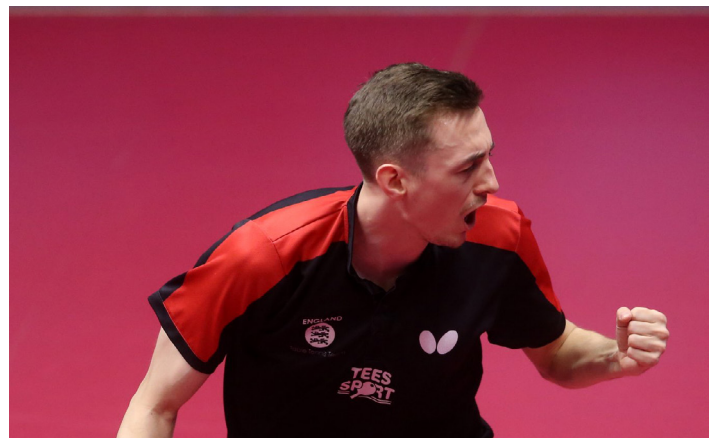
Pitchford catches the eye in Qatar!