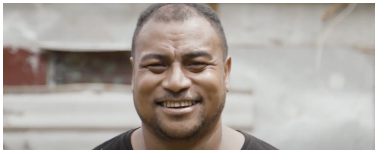
Click to watch "Smash Down Barriers"