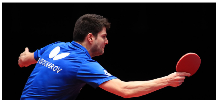
Click to watch Dima in full flight

The month of continental-focused content kicked off with ITTF in Europe Week. Whilst in lockdown, two of Europe's finest women's players connected with one another via an Instagram Live Takeover, as Austria's Sofia Polcanova logged into the ITTF's official account to give Romania's Elizabeta Samara a call! The ITTF also published a special video looking back at the very best of Germany's Dimitrij Ovtcharov, featuring a breathtaking compilation of Dima's most spectacular shots throughout his career. Delving deep into the archives, fans were also treated to classic all-European encounters from years past, including the dramatic 1993 World Championships men's singles final between Jean-Philippe Gattien and Jean-Michel Saive.