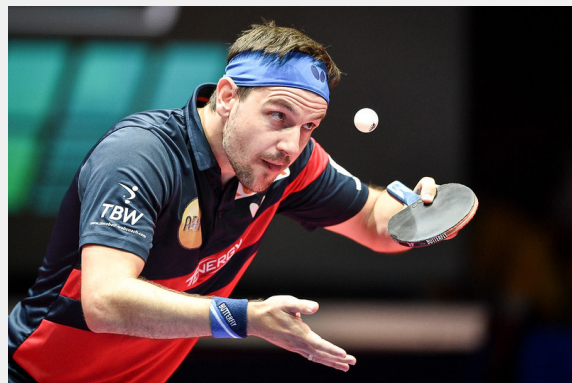
Timo Boll among the guests of the "Table Tennis at Your Fingertips" series.

Click to watch the Weekly Training Lessons!