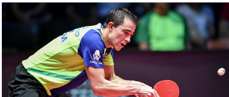
Click to meet "The Thrill from Brazil"

Classic throwback matches were aired for fans to re-live the very best contests involving Pan American star names, such as USA's Lily Zhang's epic 2019 Women's World Cup victory over Japan's Miu Hirano and Brazil's Hugo Calderano defeating world no.1 Fan Zhendong at the 2018 World Tour Grand Finals. Calderano's incredible career to date was celebrated again with the showing of ITTF's exclusive film "Hugo Calderano – Outside the Venue."