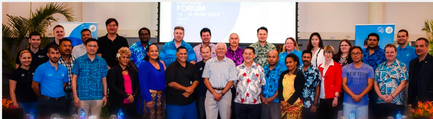
ITTF-Oceania will hold its AGM on Saturday 22 August.

New territory for continental Annual General Meetings (AGM), ITTF-Oceania will break new ground on Saturday 22 August, hosting the first AGM by a continental federation in a new digital form with online voting procedures.