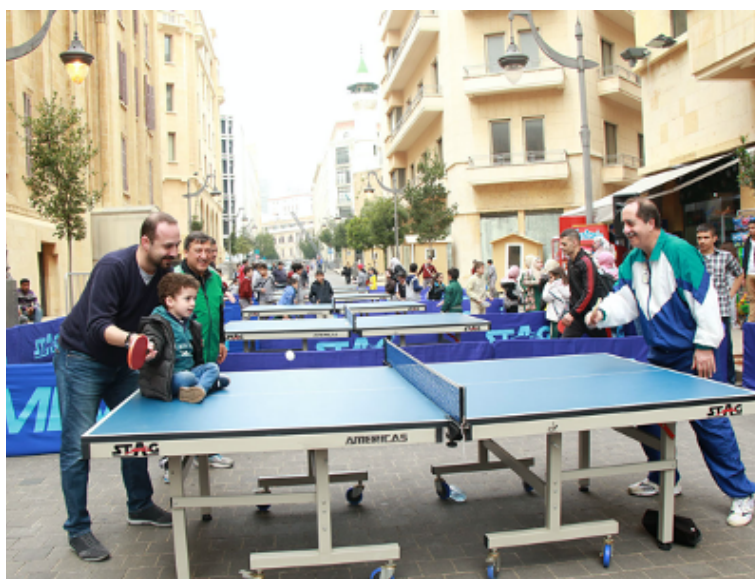
The ITTF stands with the people of Lebanon through this difficult time.

Having evaluated the situation, paying close attention to Lebanon's table tennis community, a sum of USD 30,000 has been donated towards projects designed to re-activate table tennis in the nation, using the sport for positive social outcomes. The funding derives from the donations received for the #TableTennisUnited donation campaign, after the grant panel approved this as an exceptional use with incoming donations significantly higher than the applications received. READ MORE